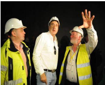
Picture 2. Tunnel adit