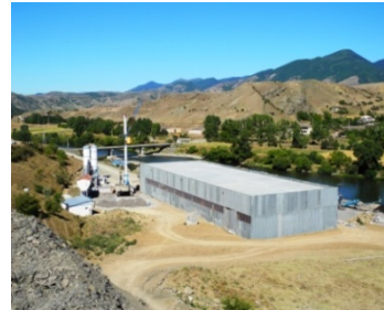
Picture 4. TBM